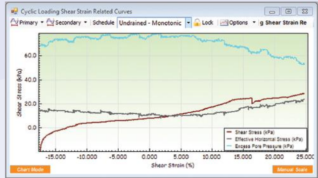
Cyclic Loading Monotonic Shearing Graph