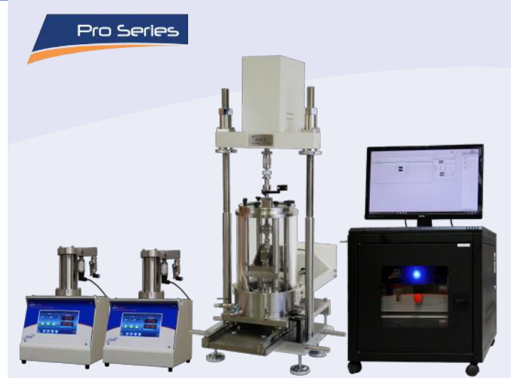
Dynamic Simple Shear with Confining Pressure Testing System

VJT-csDYNSS-C Clisp Studio Dynamic Simple Shear with Confining Pressure Software