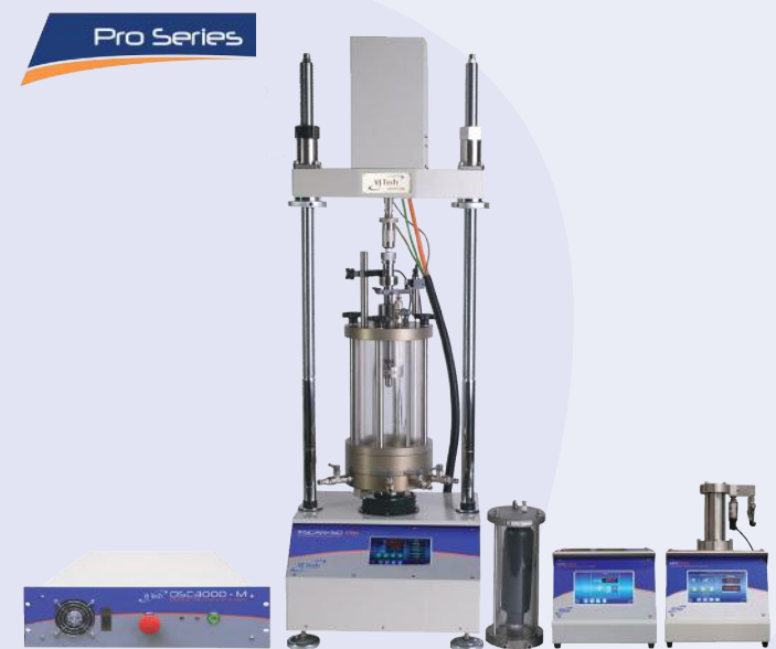
Dynamic Triaxial system with a 50 kN TriSCAN frame