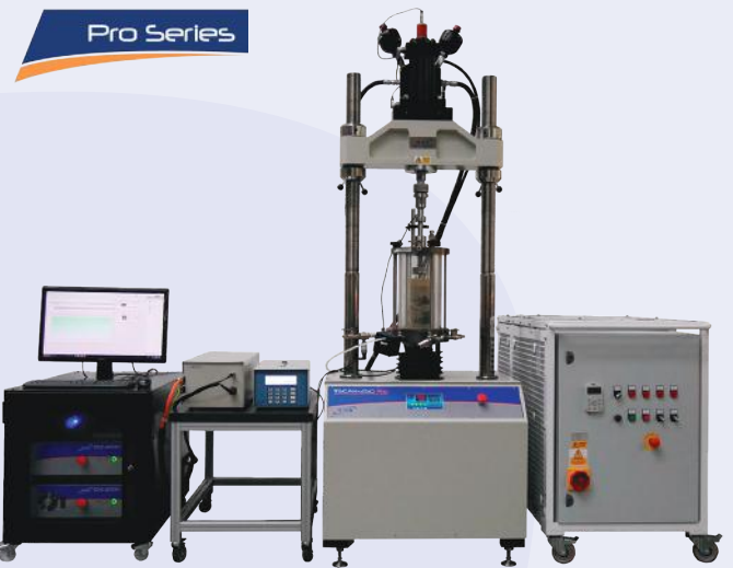
Dual Axis Hydraulic Dynamic Triaxial system with a 250 kN TriSCAN frame