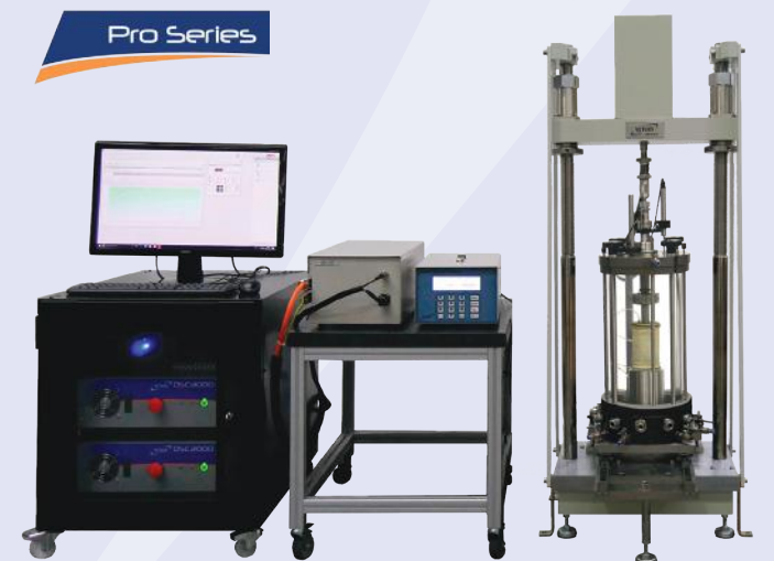
Dynamic Triaxial (Mechanical (3-Phase)) with DPC System